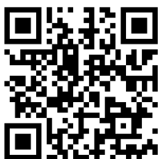
Instruction of dismantling

Address: 6F, No.423, Sec. 3, Mingzhi Rd. , Taishan Dist., New Taipei City 24355, Taiwan (R.O.C.)